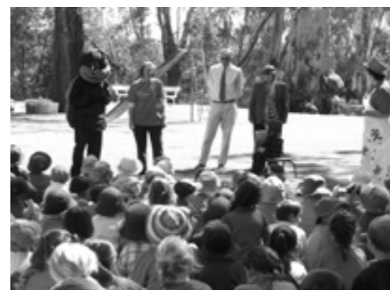
READING IN THE PARK AT WARREN