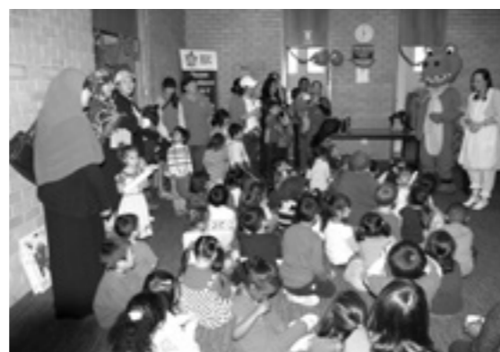
REDSEE AT GRANVILLE