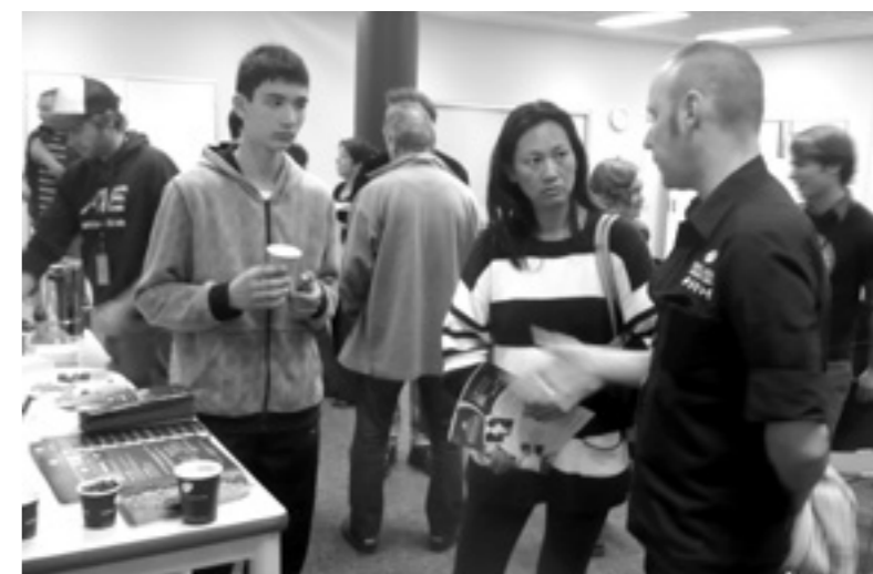
BARISTA AND FANS