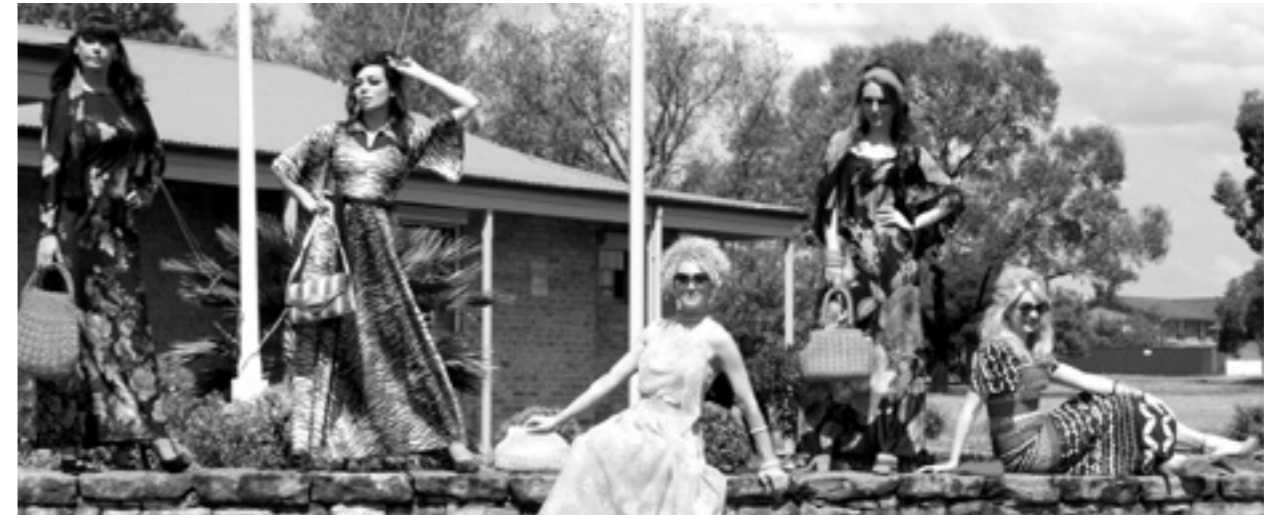
THE VINTAGE ALLSORTS