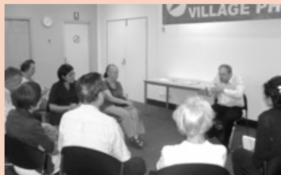
HEALTH TALKS AT RANDWICK