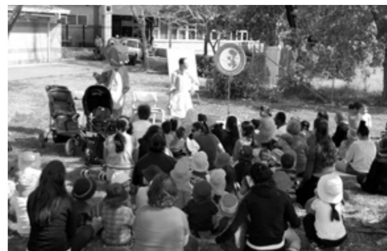
LITTLE BO PEEP AT GUILDFORD