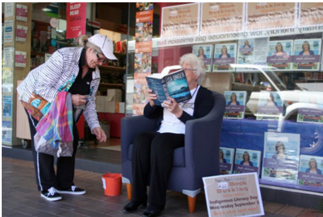
BOOK BUSKING IN MOSMAN FOR INDIGENOUS LITERACY DAY (SEE STORY PAGE 29)