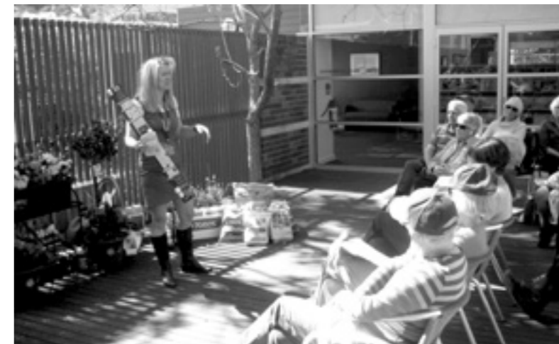
SPRING HAS SPRUNG!