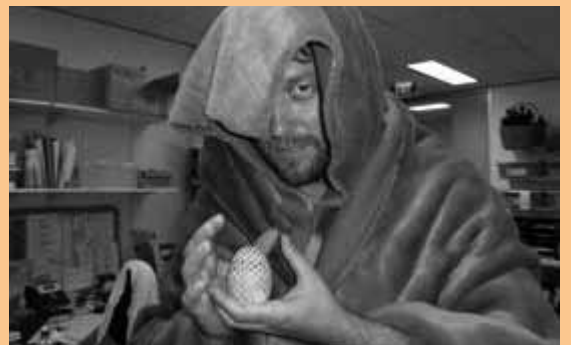
GAME OF THRONES

The night was all about the trivia: the questions were divided into two segments with a short break in between (and still they wanted more!) Although our tables spilled out of the Multifunction Room which opens into the Children's area, regular clientele appeared unfazed by the activities including