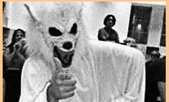
GAME OF THRONES

paper plane throwing competitions held while answer sheets were being marked. Popcorn was in continuous supply.