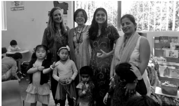
DIWALI AT EPPING