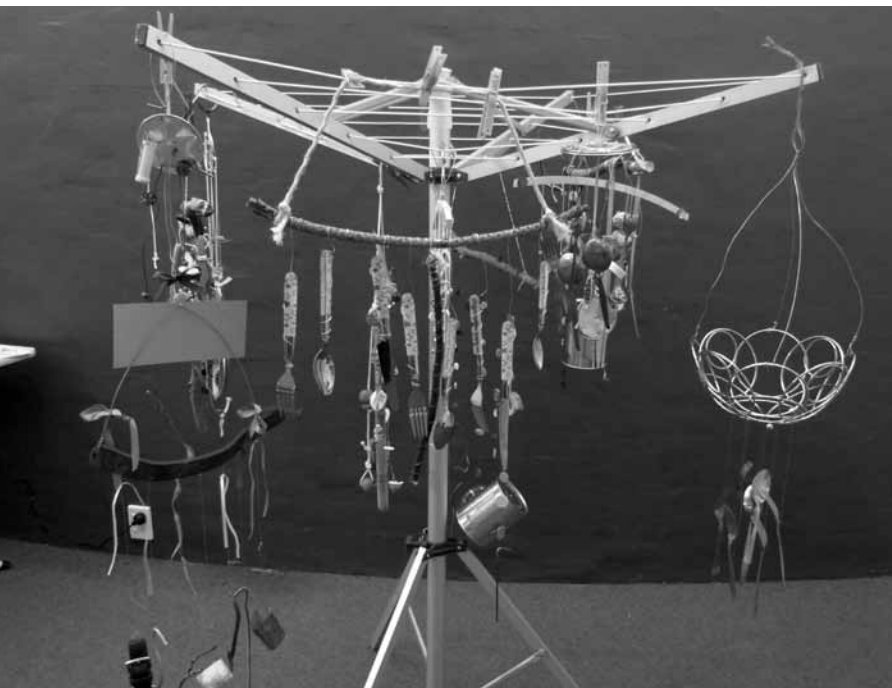
WINDCHIMES AT BATHURST LIBRARY