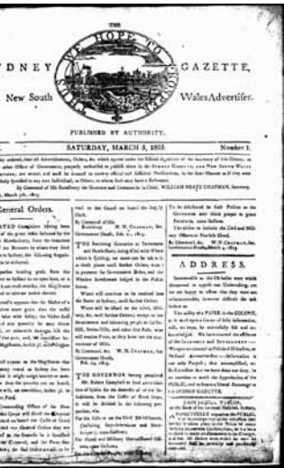
SYDNEY GAZETTE AND NSW ADVERTISER