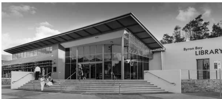
THE NEW BYRON BAY LIBRARY

The design maximises the use of controlled natural lighting to provide outlooks for the building's occupants as well as to minimise the requirement for artificial lighting. The extensive highlight windows bring plenty of even natural light into the interior zone. The hot water for the building is solar boosted and, as an added energy saving feature, the water circulates through the hot end of the air conditioning units which heats the water and takes heat from the refrigerant, increasing the efficiency of hot water provision and air conditioning. Rainwater runoff from the site and roof is caught in an underground