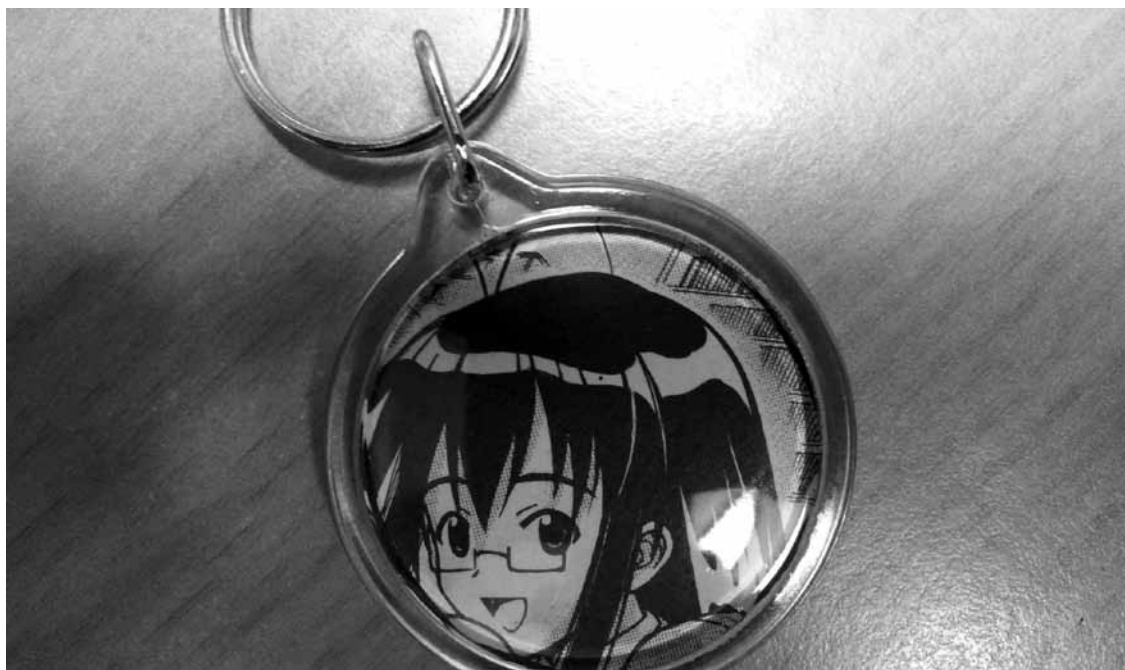
MANGA KEY RING AT SHELLHARBOUR

music track, with the expertise of music industry expert, Vuli Mkwanzani, was completely booked out. Teen chocolate fiends were lured to the chocoholics workshop where they created a range of yummy chocolates in moulds with a variety of fillings. Quite a sweet way to end the school holidays!