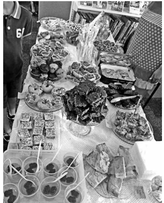
CAKE STALL AT SHELLHARBOUR FUN DAY

On Monday 21 January 2013, Shellharbour City Libraries kicked off the new year with their Family Fun Day. On the day over 1,400 young people and their families were treated to an array of activities and workshops. There really was something for everyone! You could visit the beauty bar and have