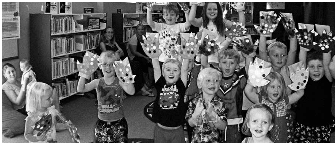
BOOKS AT BEDTIME AT BLAND SHIRE LIBRARY