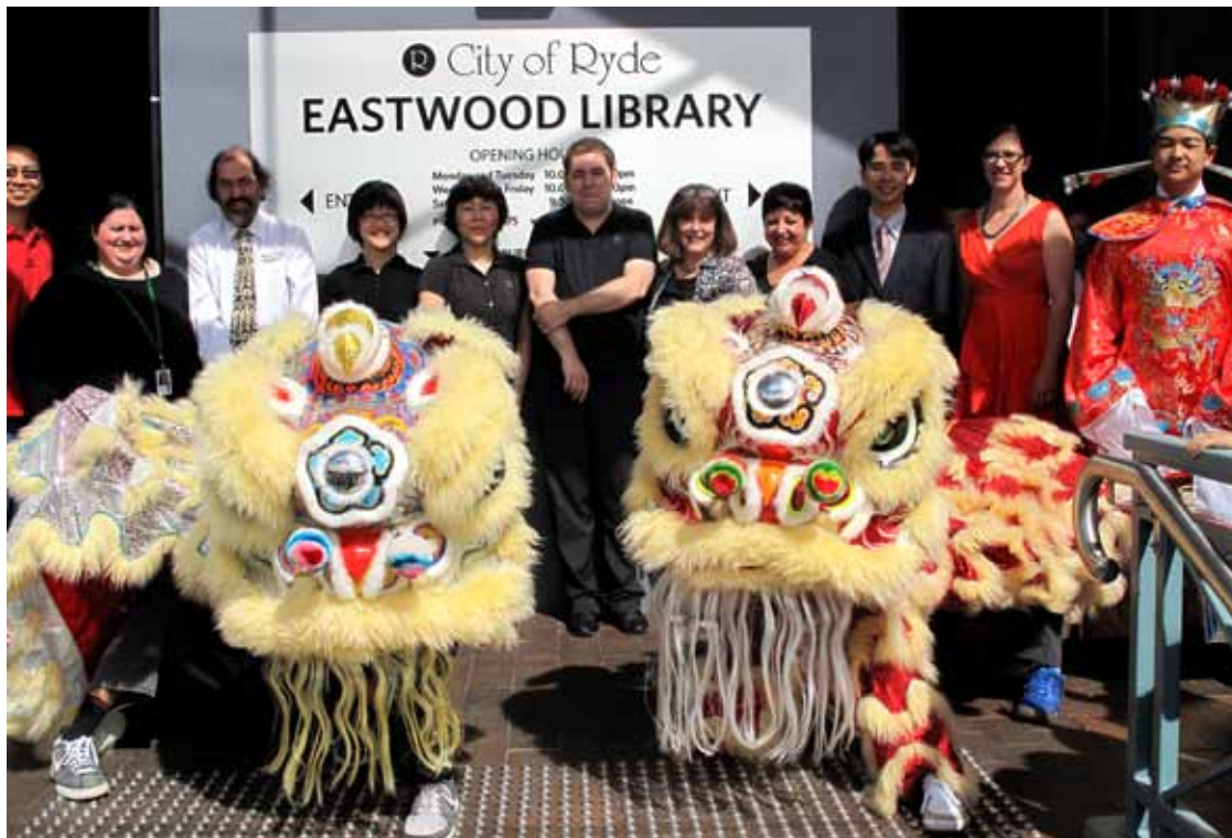
LION DANCES AT EASTWOOD (SEE STORY PAGE 2)