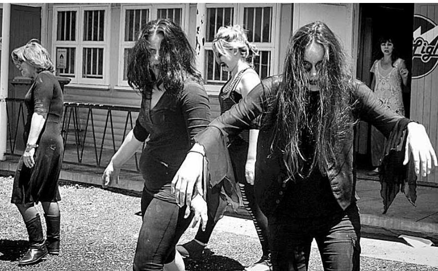
ZOMBIES AT TULLAMORE