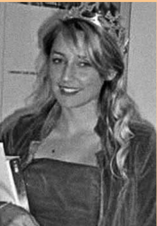
GAME OF THRONES