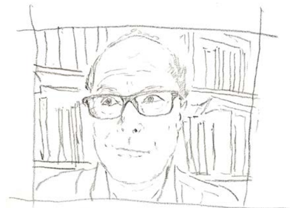
THE STATE LIBRARIAN, SELF-PORTRAIT, 2019