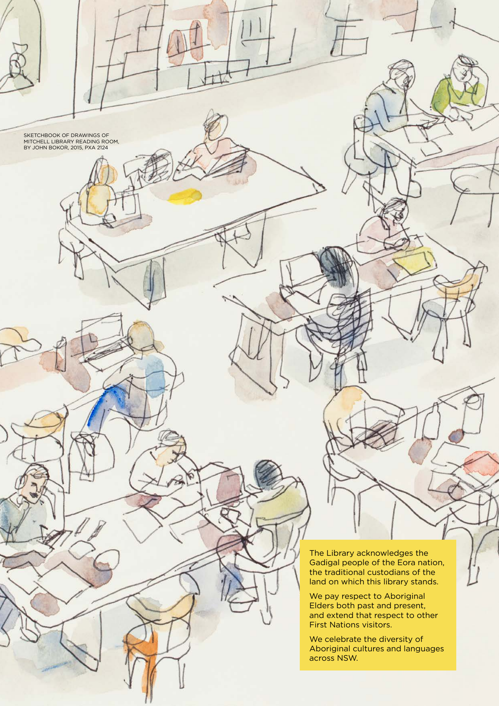
SKETCHBOOK OF DRAWINGS OF MITCHELL LIBRARY READING ROOM, BY JOHN BOKOR, 2015, PXA 2124

The Library acknowledges the Gadigal people of the Eora nation, the traditional custodians of the land on which this library stands.