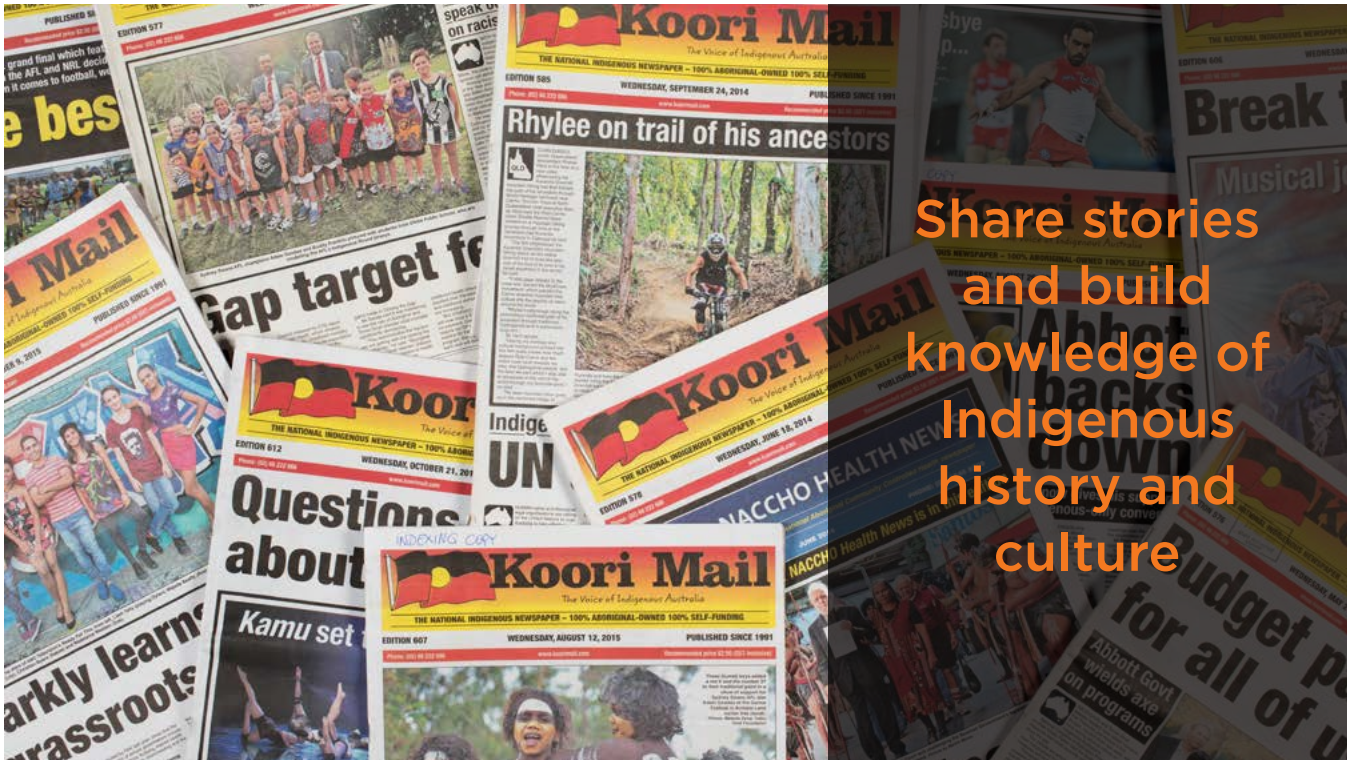
KOORI MAIL MAGAZINE IN THE STATE LIBRARY COLLECTION