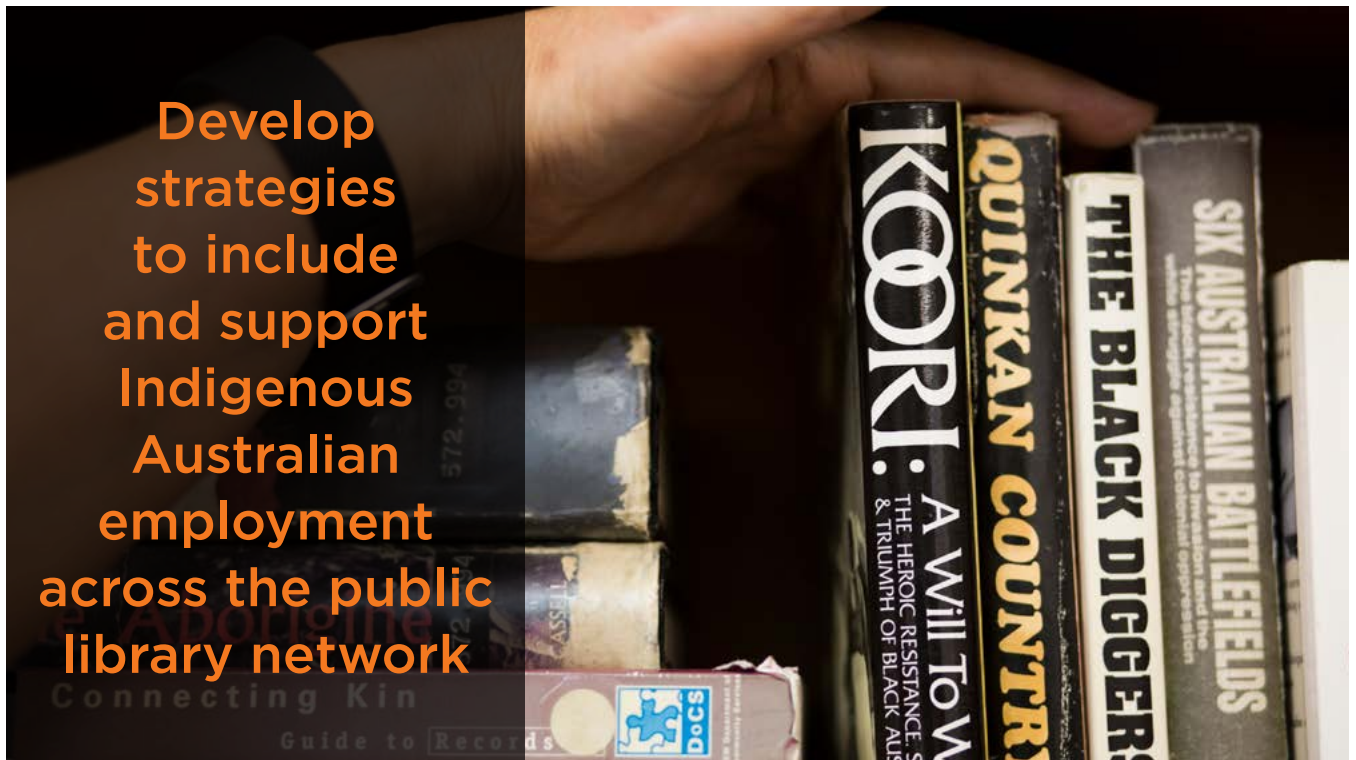
INDIGENOUS PRINTED COLLECTIONS, MITCHELL LIBRARY